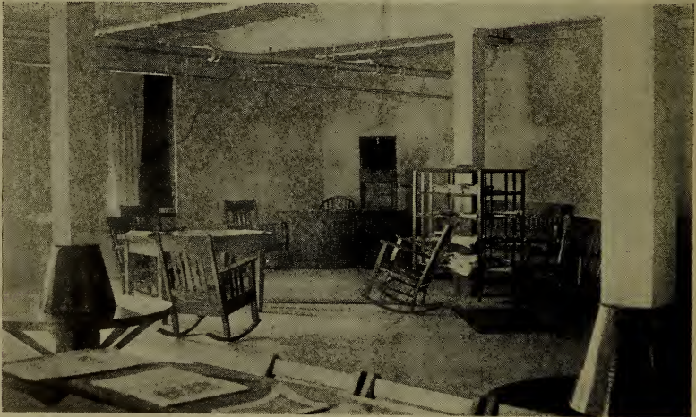
Club Room in Loyalty Hall.

The city of Decorah has a large and well appointed opera house where there is an opportunity to hear good concerts and be entertained in other ways. The College has maintained a Lyceum Course the last two years, providing entertainment of a wholesome and instructive nature. Lectures at the College by prominent graduates serve to vary the daily routine.